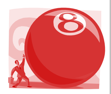
Hello — Collection Companies!

The department has received 611 Renewal Application packets and has issued 535 renewal permits for collection agencies